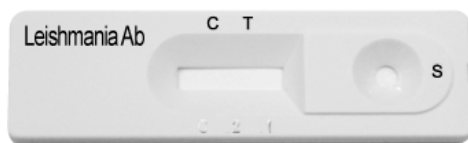
Fig. 1: CLI-Ab device.

ImmunoRun CLI Antibody Detection Kit contains individual devices intended for performing immuno-chromatographic assays to qualitatively detect CLI-Ab in dog whole blood/serum/plasma specimens. Each device contains 2 windows. A small round window marked with "S" is the specimen application well, where the assay diluent is also applied and a rectangular result window marked by 2 letters: "T" marks the test line and "C" marks the control line (See Fig. 1). Both lines are invisible before reaction takes place. The control purple line should appear with each ongoing reaction as it is used for validation of the test. The specially selected CLI antigen is used as both capture and detection reagents. Antibodies anti-CLI in specimen bind to the gold conjugated CLI antigen and form a complex that migrates to the area where it is captured, and its accumulation creates a band - a purple test line. These enable CLI Ab device to identify CLI antibodies in canine blood/plasma/serum with a high degree of accuracy.